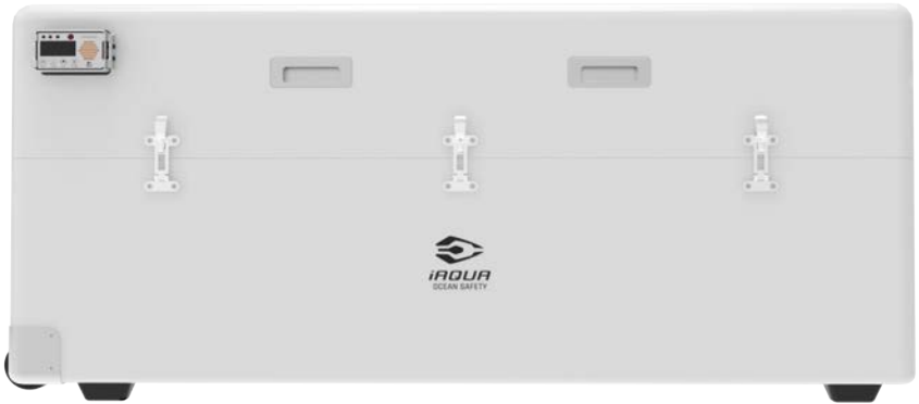
LF335 - €7,870+IVA L1330 x W605 x H592mm / 335 litres