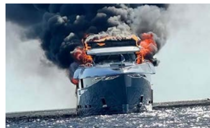
Fire on motor yacht MY Blue Magic, bay of Naples, Italy.