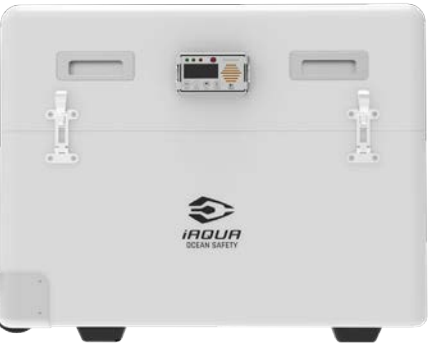
LF120 - €4,860+IVA L680 x W530 x H535mm / 120 litres