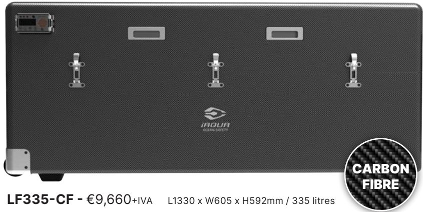
LF335-CF - €9,660+IVA L1330 x W605 x H592mm / 335 litres