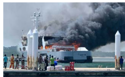
Fire on yacht MY Lady D, port of Lignano Sabbiadoro, Italy