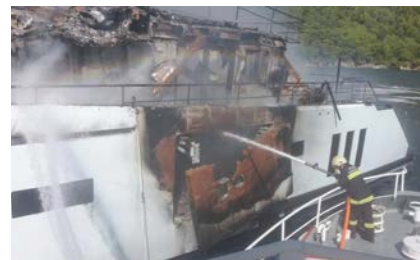
Lithium e-board fire destroys 44m MY Kanga, Dubrovnik, Croatia