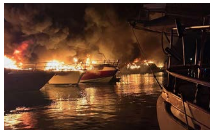
Fire Destroys 8 yachts docked in La Paz, Mexico