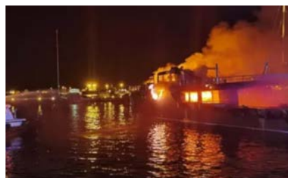
Superyacht MY Siempre, moored at the port of Olbia, Italy.