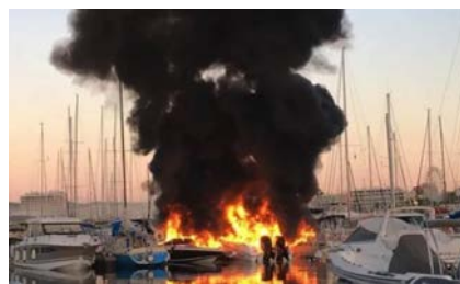
Fire ravaged three 8m boats in the port of Lavandou, France.