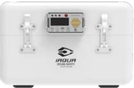
LF18 - €2,490+IVA L430 x W330 x H280mm / 18 litres

Please place your order with your local stockist (found on the back cover)