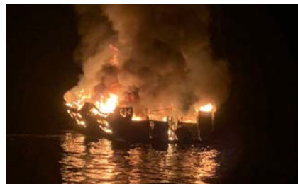
34 people died in lithium blaze, Santa Cruz, California