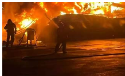
28m Sunseeker Black Diamond destroyed, IMS Shipyard, Saint-Mandrier, France.