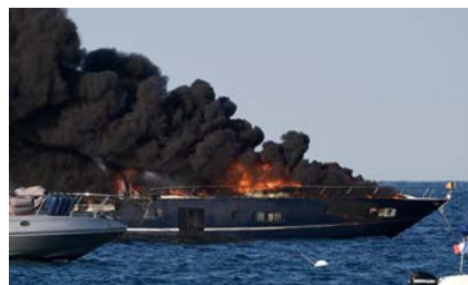
Fire broke out on sailing yacht L'Odyssée, bay of Saint-Tropez.